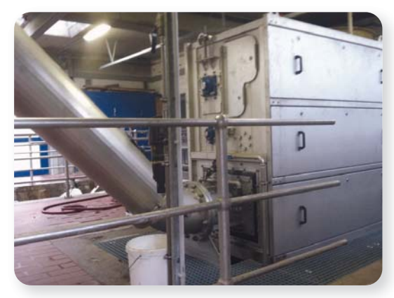
Completely Enclosed for Odor Control.