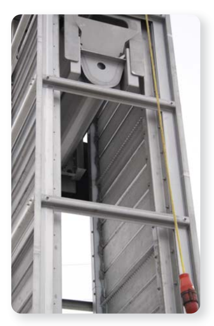
Solids are collected just below the discharge point at the apex of the filter belt.