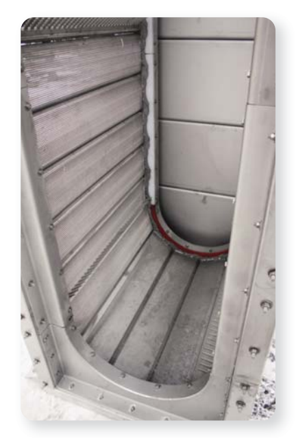
Special side seals on the frame prevent by pass.