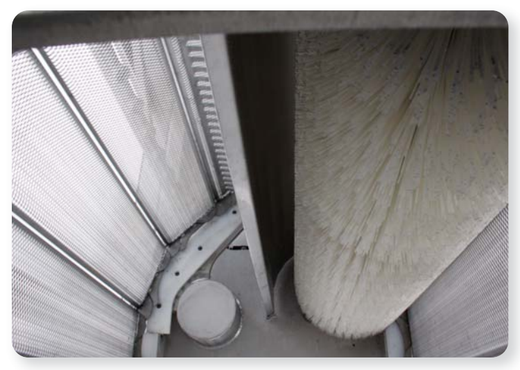
No carry over of screenings to downstream process.